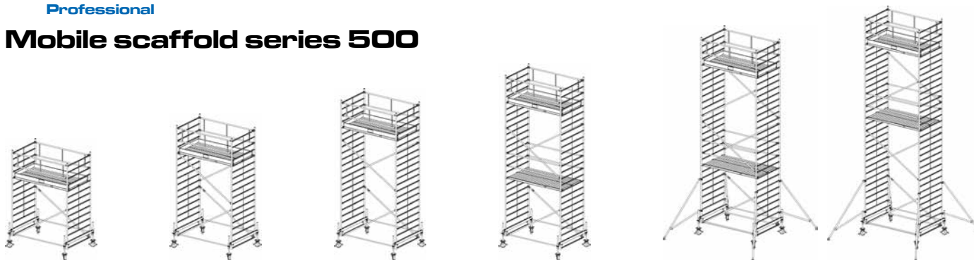
Working height: 4.40 m Scaffold height: 3.40 m Platform height: 2.40 m