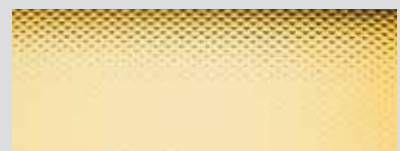
PVC and EPDM membrane